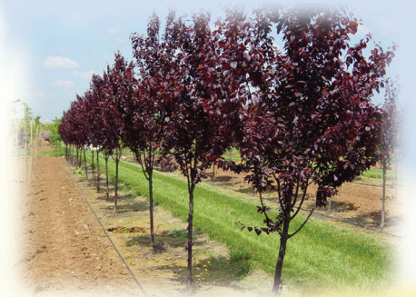
Cherry Plum Tree

TAKE CHARGE OF YOUR DEFENSIBLE SPACE BY LIMBING YOUR TREES The Spacing Between Grass, Shrubs, and Trees is Crucial to Reduce the Spread of Wildfires.